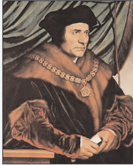
Saint Thomas More Council #14270 Kansas City, Missouri