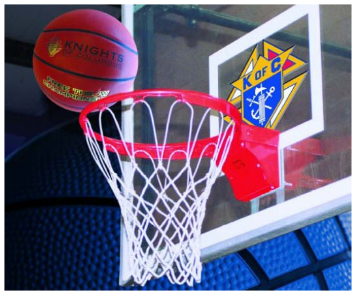
2012 Free Throw Championship Sunday, January 8 ♦ 6:00 PM to 8:00 PM Open to boys & girls age 10 to 14 Contact Youth Director Jeff Barthol 942-3267

In lieu of flowers the family requests that donations be sent to: The First Tee of Greater Kansas City, 7501 Blue River Rd, Kansas City, MO 64132.