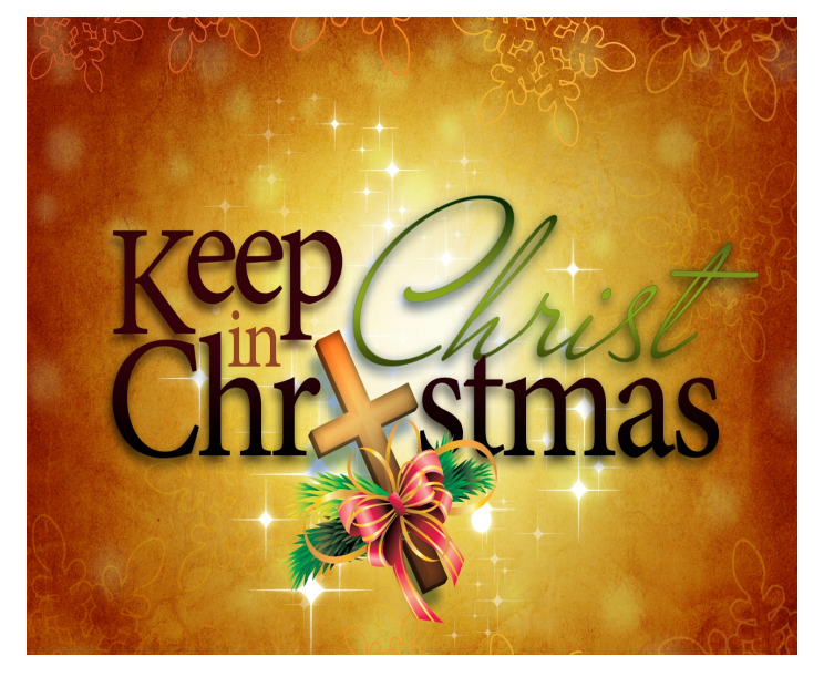
Jesus is the Reason