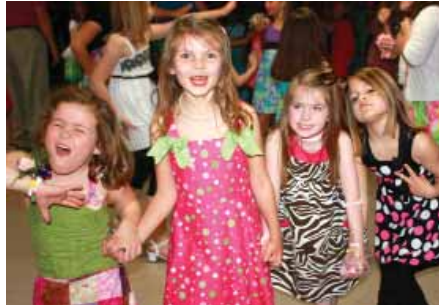
Kindergarten girls showing their true colors on the dance floor.

Stewart. After months of preparation, More Hall was magically transformed into "Candy Land" for the night and the guests were met with lollipops, gumdrops, peppermints and gingerbread in every shape and rainbow color.